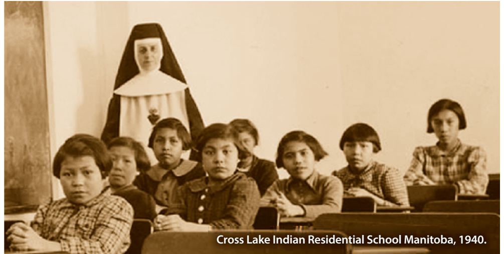
Cross Lake Indian Residential School Manitoba, 1940.

New processes taking shape cannot always fit into frameworks imported from outside; they need to be based in the local culture itself. As life and the world are dynamic realities, so our care for the world must also be flexible and dynamic. Merely technical solutions run the risk of addressing symptoms and not the more serious underlying problems.