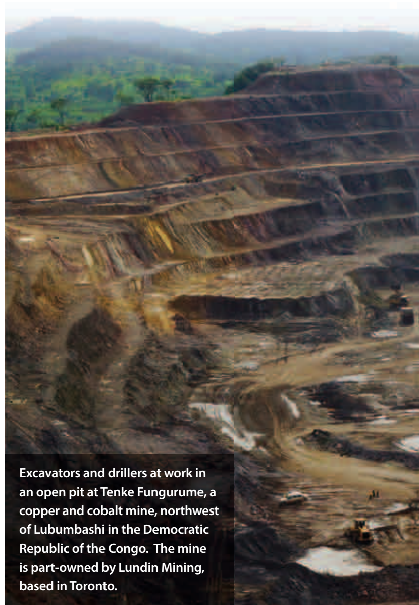
Excavators and drillers at work in an open pit at Tenke Fungurume, a copper and cobalt mine, northwest of Lubumbashi in the Democratic Republic of the Congo. The mine is part-owned by Lundin Mining, based in Toronto.

The warming (of the climate) caused by huge consumption on the part of some rich countries has repercussions on the poorest areas of the world, especially Africa, where a rise in temperature, together with drought, has proved devastating for farming. There is also the damage caused by the export of solid waste and toxic liquids to developing countries, and by the pollution produced by companies which operate in less developed countries in ways they could never do at home, in the countries in which they raise their capital.