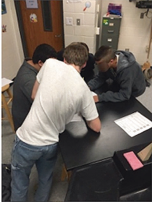
Fig. 14.3 “In a unisex class, we always thought that we were bigger than each other. Our egos were high”